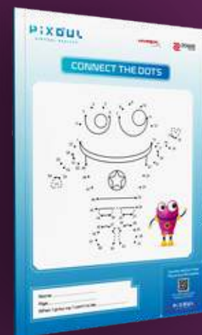
INTRO THE CODE KG1 & KG2