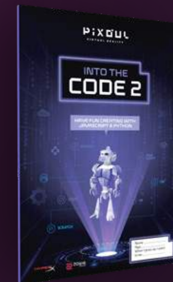
G3 to G6