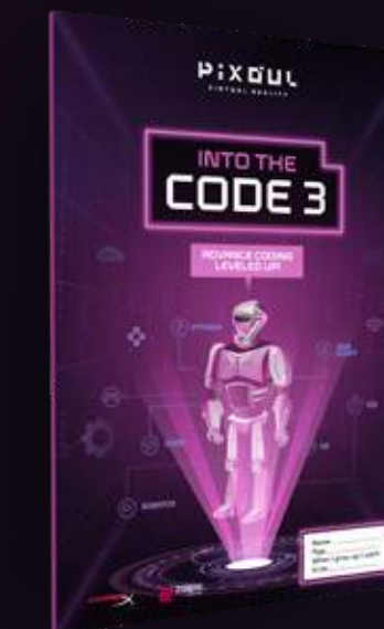
G7 to G12