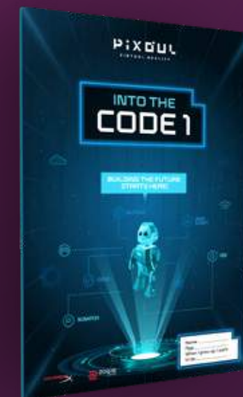
G1 & G2